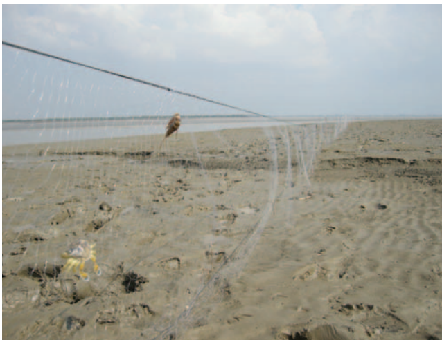
Fig. 5. Fishing nets set on c. 1 m stakes on mudflats in the Bay of Martaban, Myanmar, Jan 2010.