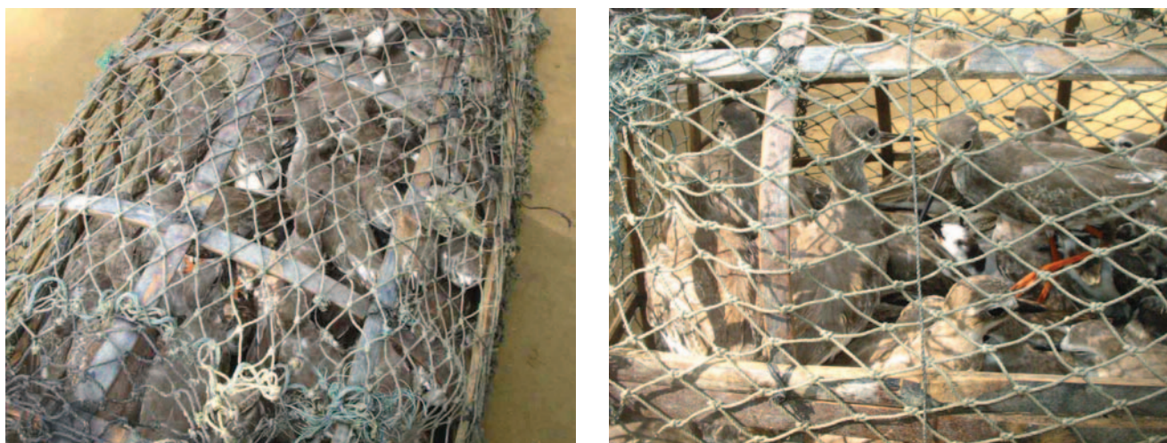
Fig. 2. Trapped waders held in cages before being eaten or delivered to market at Nan Thar, Myanmar, Jan 2009. The species cover a spectrum of those present at the site: Redshank Tringa totanus , Lesser Sandplover Charadrius mongolus , Greater Sandplover Ch. leschenaultii , Curlew Sandpiper Calidris ferruginea , Red-necked Stint C. ruficollis , Broad-billed Sandpiper Limicola falcinellus and unidentified small terns.