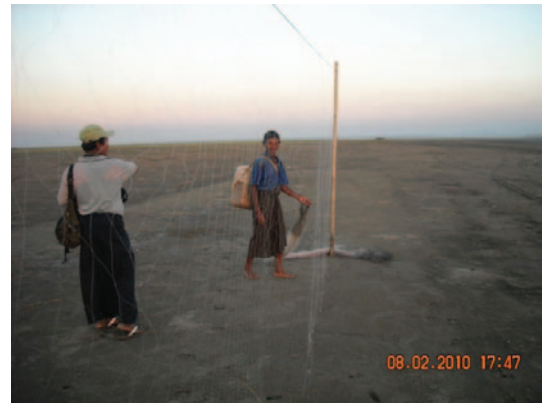
Fig. 4. Hunters setting nets to catch waders in the Bay of Martaban, Myanmar, Jan 2010. (Photos from Nyunt et al. 2010.)