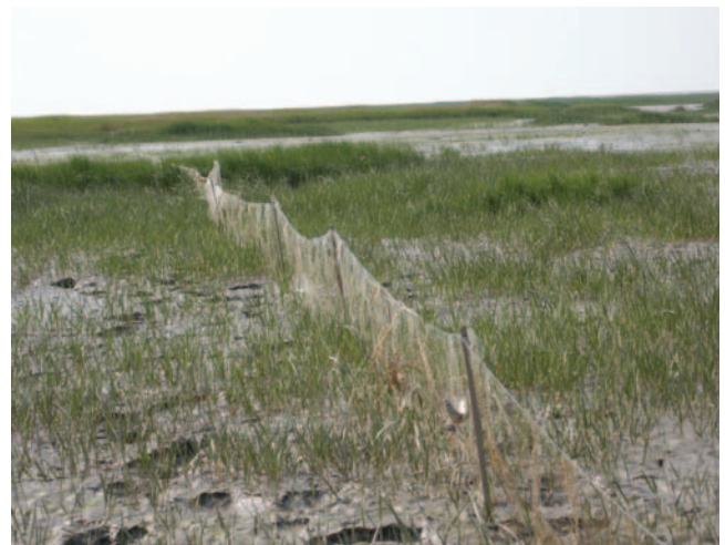
Fig. 6. Fishing nets set on c. 0.5 m stakes across small creeks on edge of saltmarsh in the Bay of Martaban, Myanmar, Jan 2010.