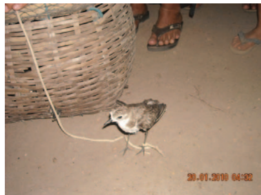
Fig. 3. Pictures from local village markets in the Bay of Martaban, Myanmar, Jan 2010. The birds reflect the range of wader species found in the Bay of Martaban with an emphasis on the smaller species reflecting their greater susceptibility to capture. Note the Greater Sandplover Charadrius leschenaultii which may have been bought for release at a religious shrine. (Photos from Nyunt et al. 2010.)