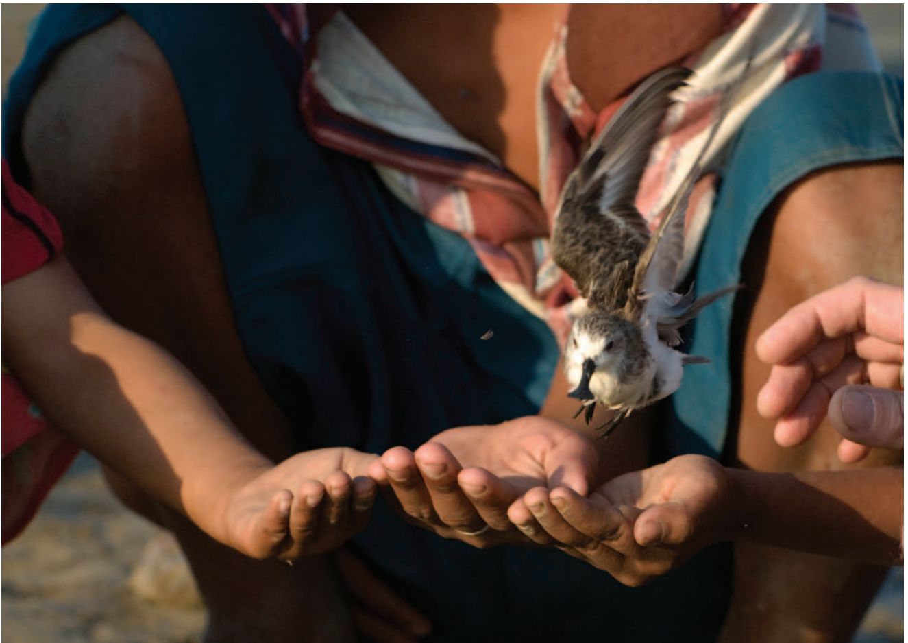
A Spoon-billed Sandpiper Calidris pygmeus caught by a hunter in the Bay of Martaban, Myanmar, is released by local children after intervention by the Spoonbilled Sandpiper Expedition, January 2010.